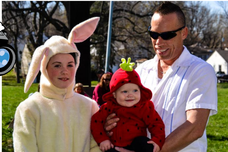
Easter Egg Hunt on April 4, 2015