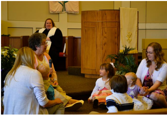
Easter Sunday Traditional Service, including Baptism and Confirmation, on April 5, 2015