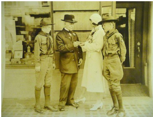
Sonora Dodd, the Mother of Father's Day, pictured with two Boy Scouts and a Civil War Veteran in Spokane.

Join us on Father's Day, June 21, before and after worship in the tower room to enjoy Donuts with all of Trinity's Dads as we thank them for all of the wonderful things that they do!