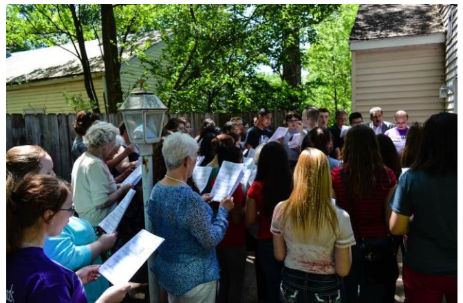
Trinity's Choir Volunteers at a Local Homebound High School Graduation May 17