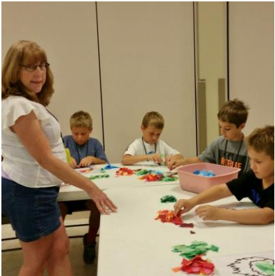
VBS with First Presbyterian and First Christian Churches, June 28 – July 1