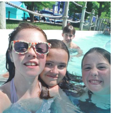
Trinity Youth at Worlds of Fun with Heartland Presbytery, July 14