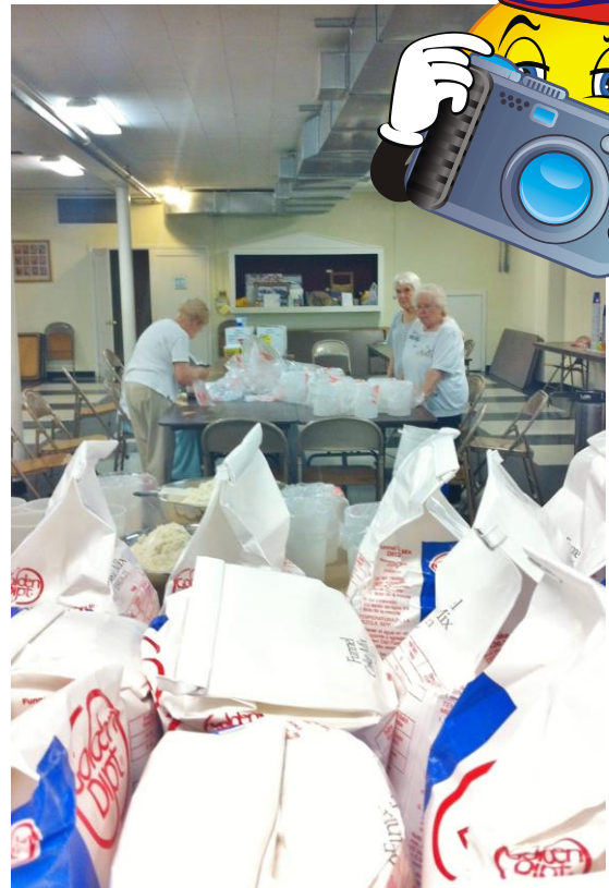
Scaling a mountain of funnel cake mix!