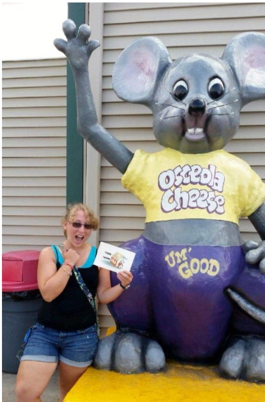
Flat Trinity at Osceola Cheese