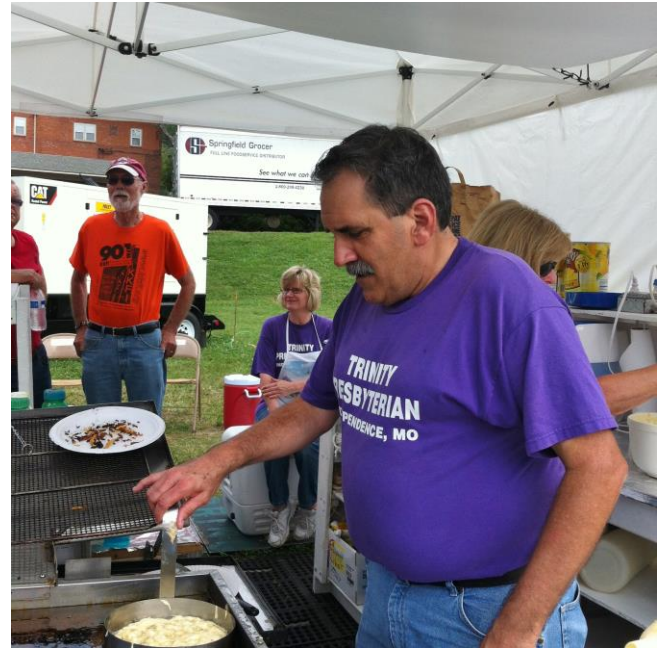
Funnel Cake Booth at Wayne's City Landing