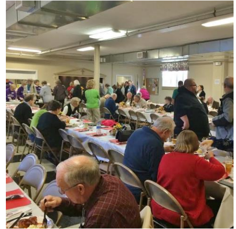
Lunch for 200+!

for all your hard work to make this day go smooth” from Presbytery staff. Friends you outdid yourselves and proved that even a small church could work together for an event of this magnitude.