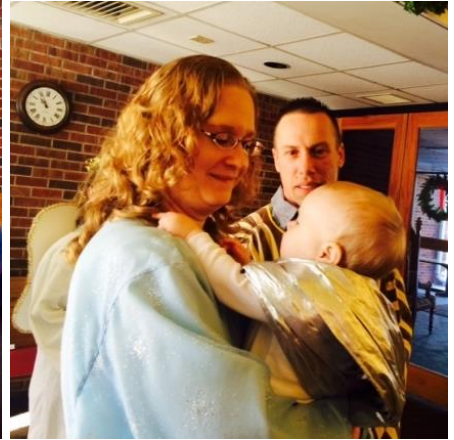
Epiphany Pageant on January 4